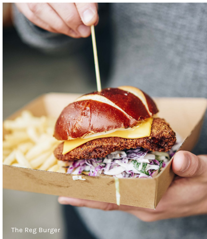
The Reg Burger

*Your choice of three burgers, The Reg, The Cheese Burger or the Halloumoi Burger. 1 per person - yeah boi! Hungry crowd? cater 1.5 burgers per head for $7, or a second burger per head for $12.